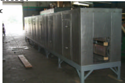
For A Floor Mounted Conveyor