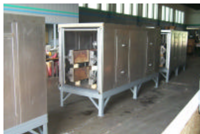
Ready For Shipping