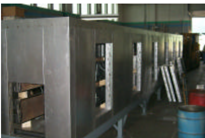
Emitter Access Doors