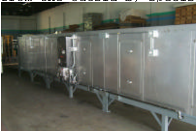
Assembled With IR Controls

Now Modular IR Ovens can now be made to your specifications and shipped to you or you customer directly....then they are merely bolted together! These ovens are completely wired and plumbed and have a new 6-Way IR Mounting Bracket for universal adjustment that will give your customer a better method of directing heat control. They are also easily accessed from the outside by special doors.