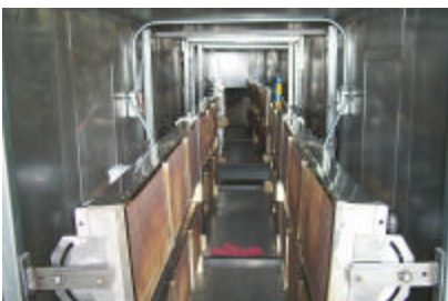
6-Way Emitter Mounts