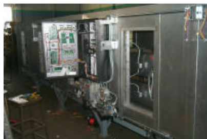
Wired & Plumbed-Gas IR