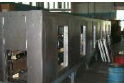
Emitter Access Doors