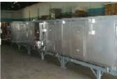
Assembled With IR Controls

The following is an example of Eagle's production capabilities.