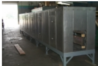
For A Floor Mounted Conveyor