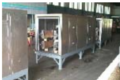
Ready For Shipping