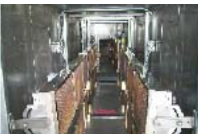
6-Way Emitter Mounts