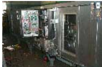
Wired & Plumbed-Gas IR